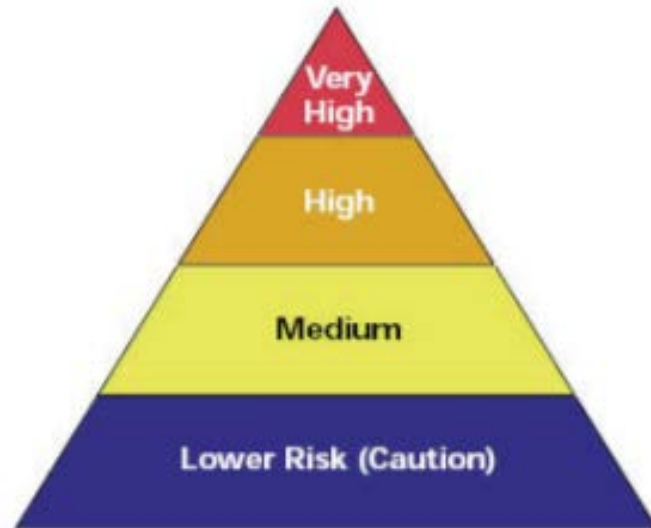
Occupational Risk Pyramid for COVID-19